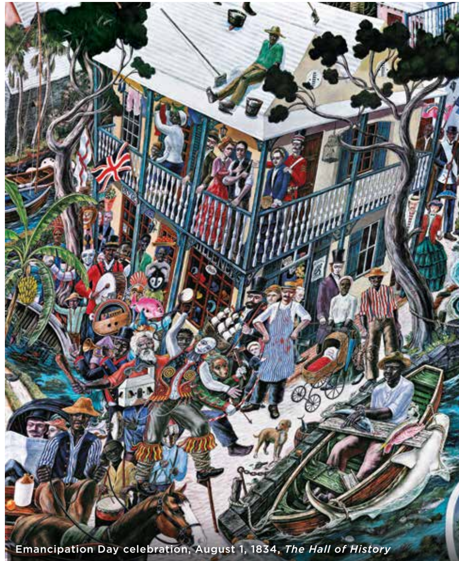
Emancipation Day celebration, August 1, 1834, The Hall of History

BY KATIE BENNETT, NATIONAL MUSEUM OF BERMUDA