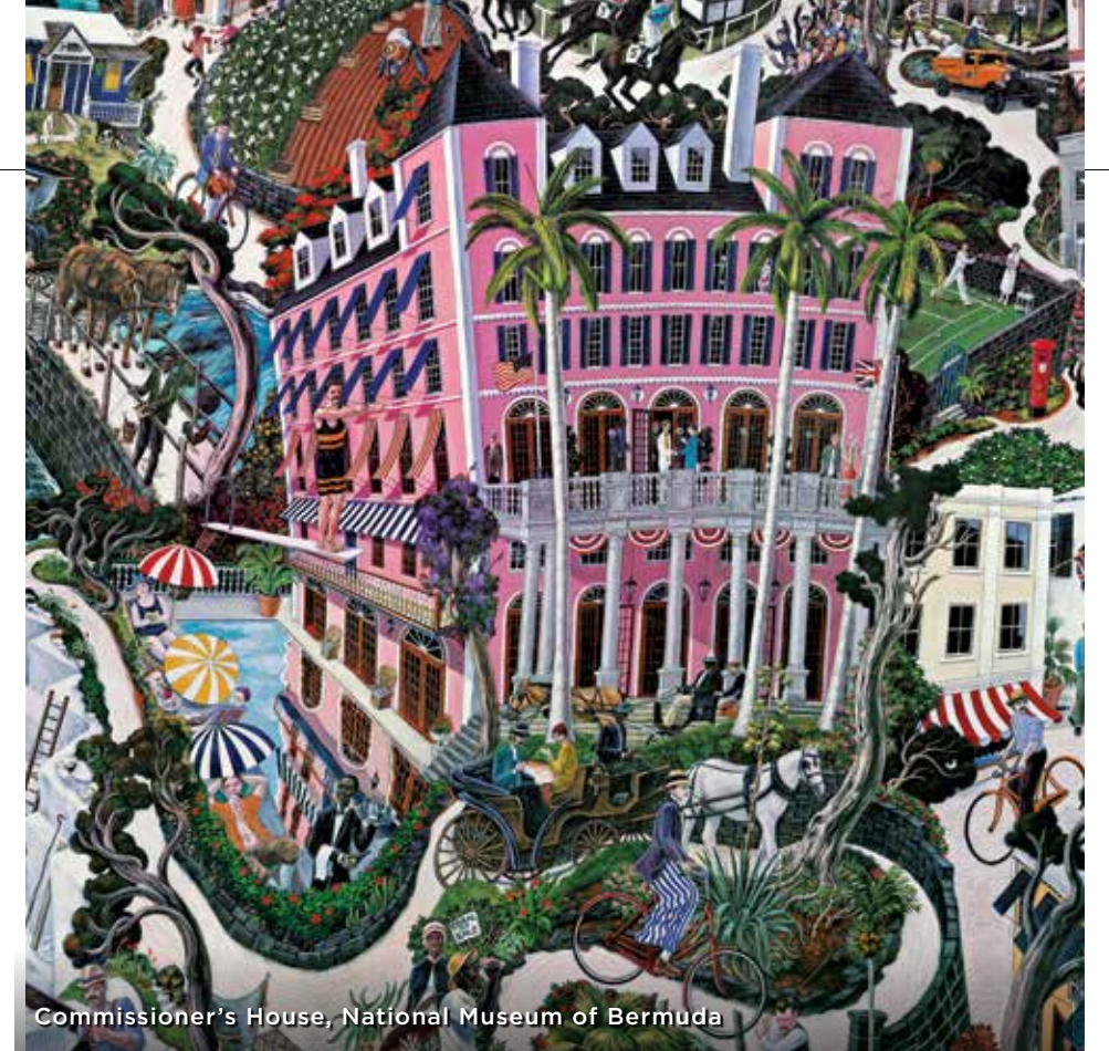
Commissioner's House, National Museum of Bermuda

The National Museum of Bermuda is housed in Bermuda's largest fort, the Keep. NMB's expansive 16-acre property includes eight historic military buildings, including the award-winning restored Commissioner's House. Exhibit topics include Bermuda's links with the West Indies and the Azores, trans-Atlantic slavery, the history of tourism and the island's defence through two World Wars, shipwreck artefacts and local watercraft. Kids will love the Museum Playground & Playhouse, complete with interactive exhibits, a slide and a giant moray eel.